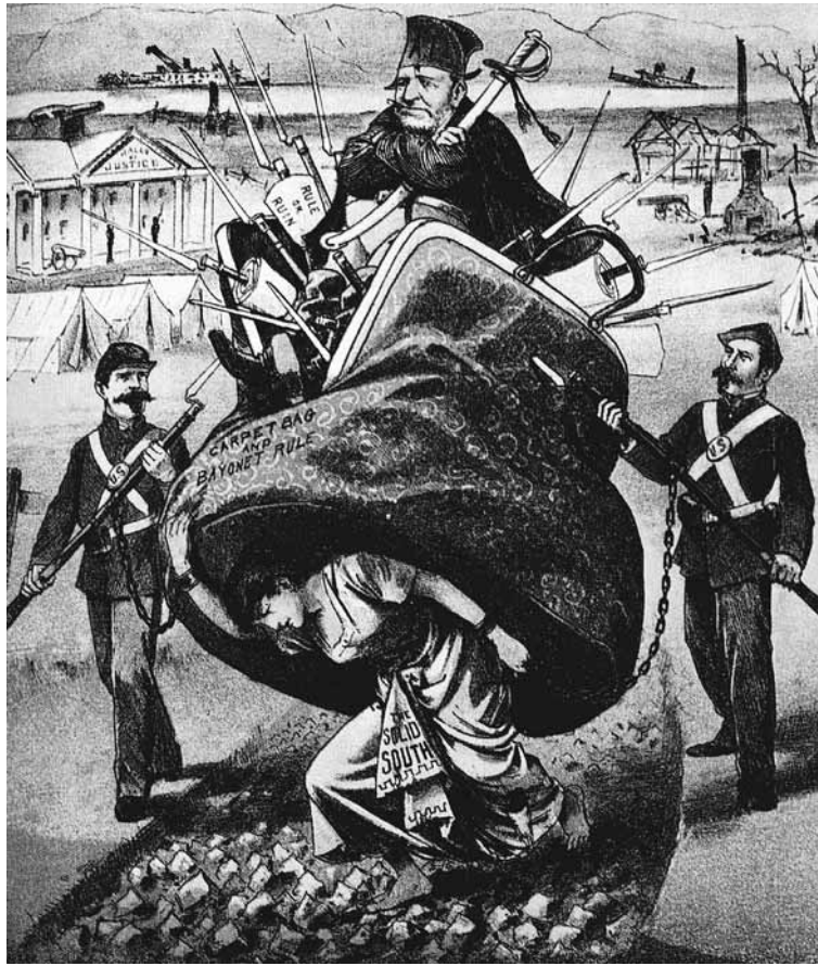
A cartoon published in 1880. The person sitting in the carpetbag is ex-President Grant, who was being considered by the Republicans as a Presidential candidate for the 1880 Presidential election.