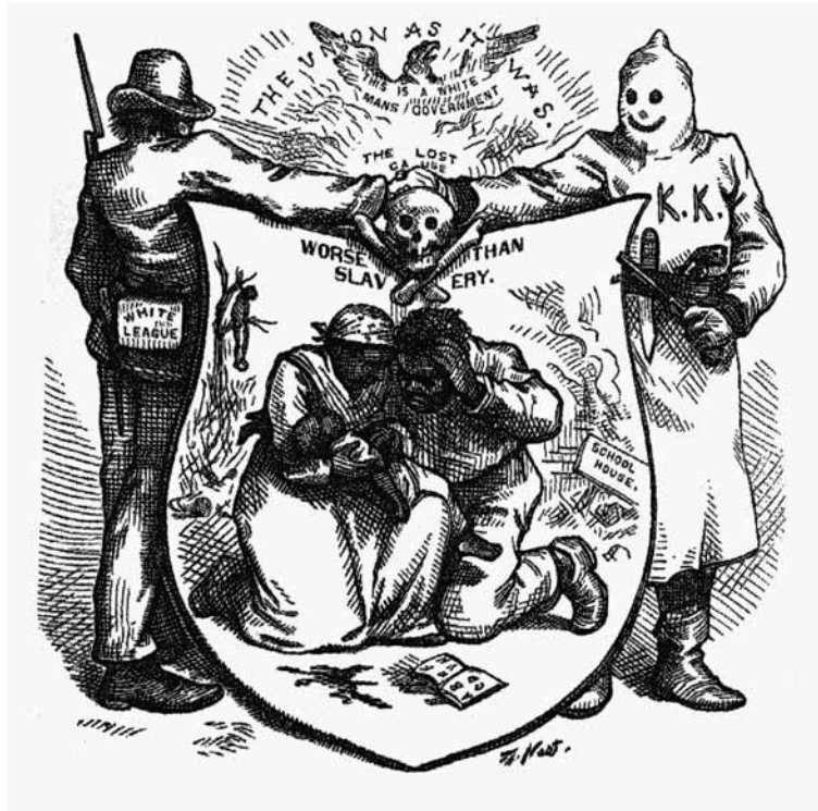
A cartoon from an American magazine published in 1874. The cartoon is called 'Worse than Slavery'.